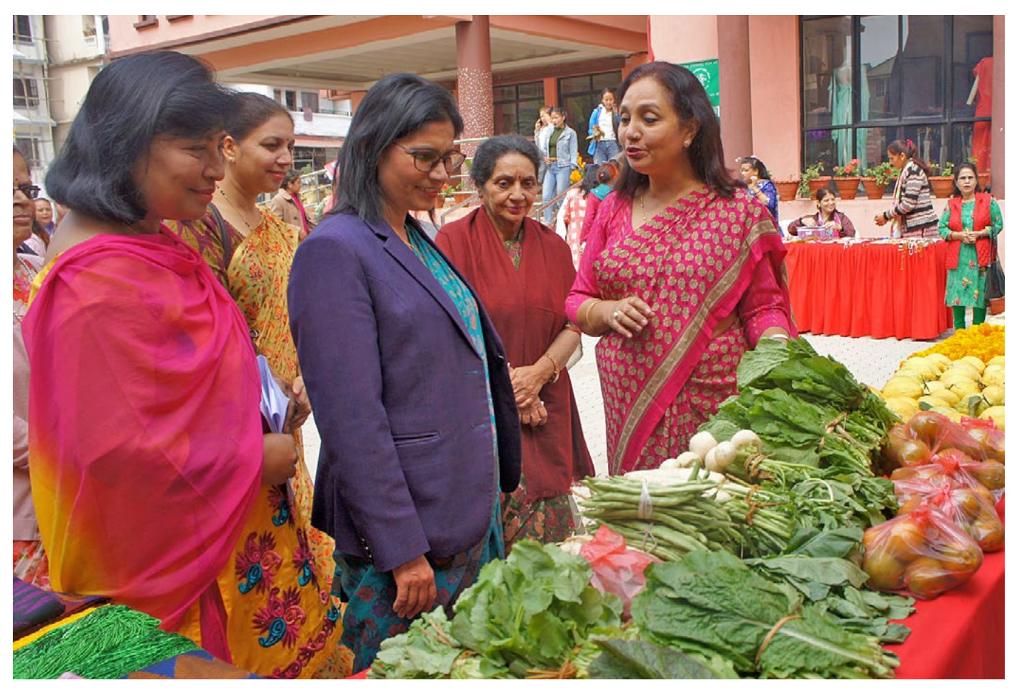
Hon'ble Padma Kumari Aryal, Minister, Ministry of Land Management, Cooperatives and Poverty Alleviation observing WHR's Monthly Haat Bazar