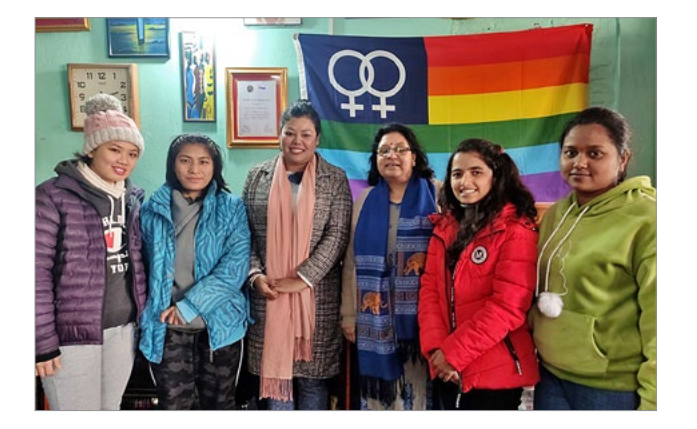
Observation visit to Mitini Nepal