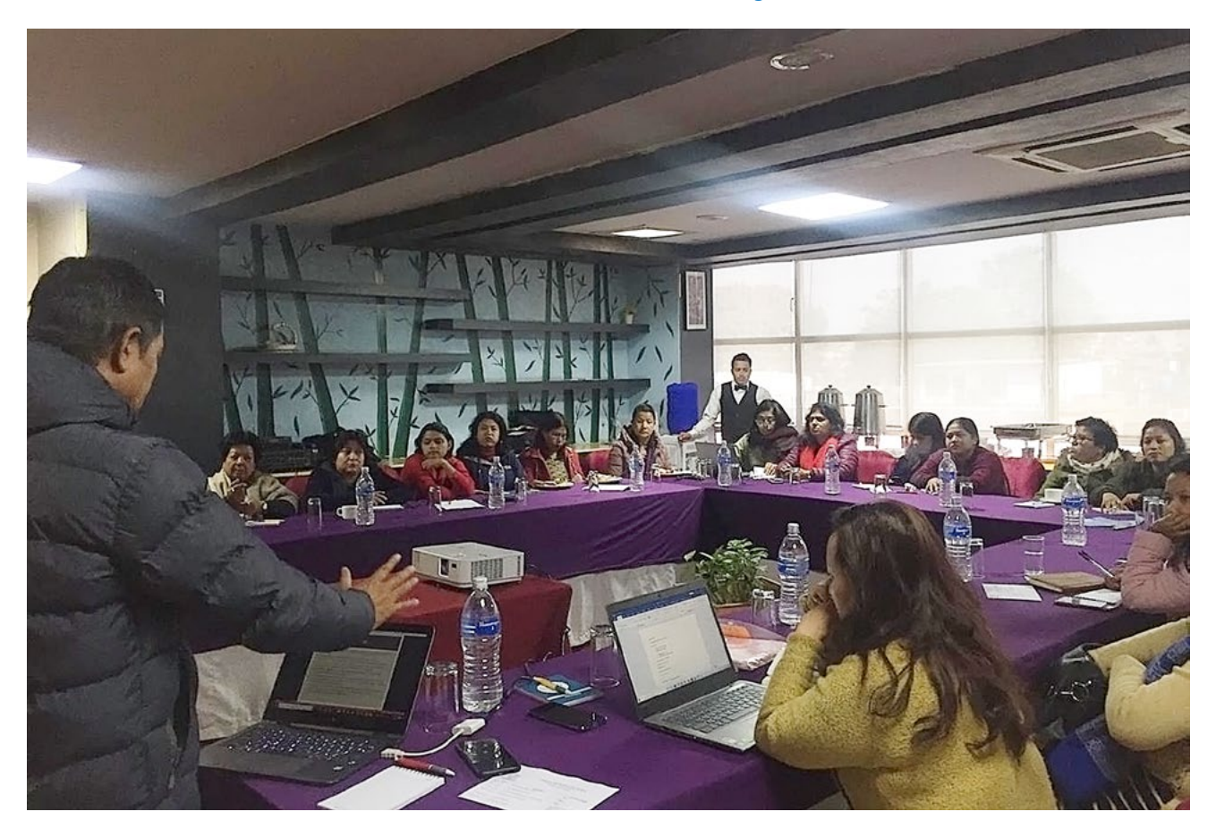
Consultation meeting with the Research Participant Organisations