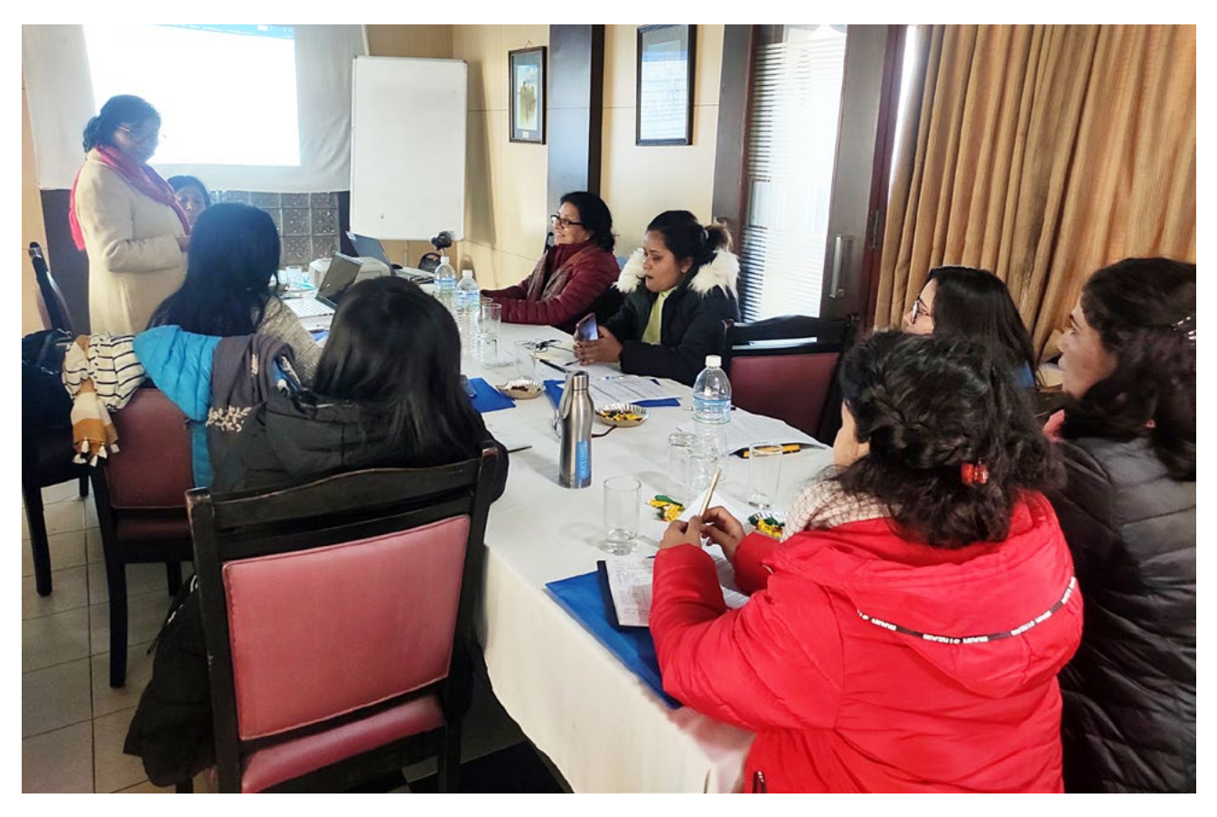
First Research Assistants Training