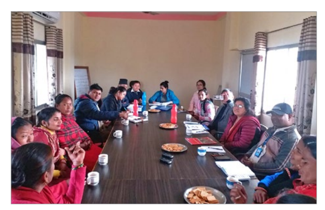
Collecting information from Informants at Shrijansil Samudayik Bikash Kendra