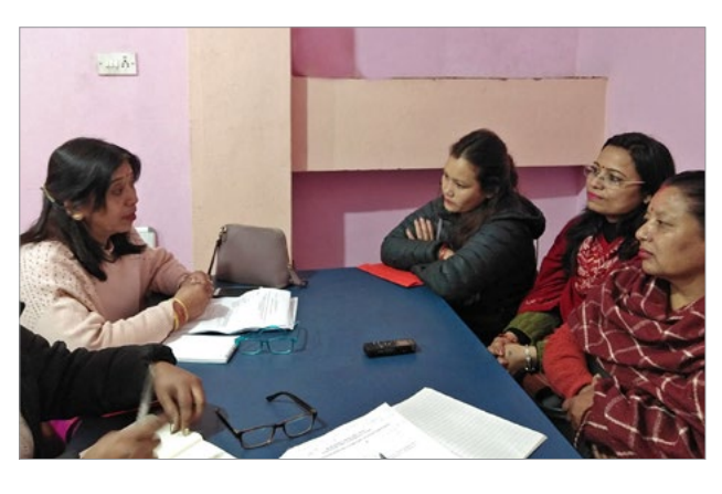
Focus Group Discussion at FBPW